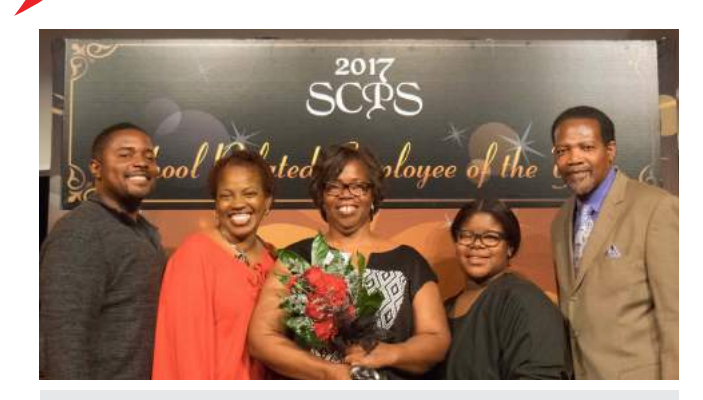
Invested $75,000 in SCPS educators, support staff and key volunteers

Distributed $2,150,000 free school supplies to support teachers and their high-need students.