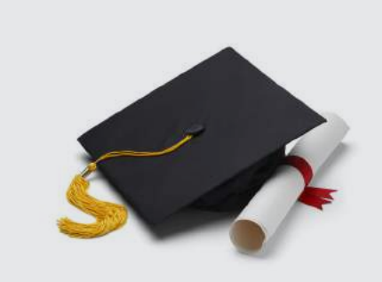
Awarded scholarships to 39 graduating seniors.